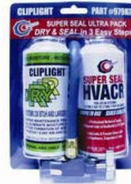
Drying Agent and Sealant fix leaks in refrigeration systems.

April 24, 2009 - Ultra Pack features 3 oz, vacuum-packed can of Dry-R, which chemically changes H 2 O to low-viscosity, non-oily, and residue-free liquid. It chemically reacts with H 2 O to form liquids soluble with AB, mineral, POE, and PAG oils used in refrigeration systems. Super Seal HVACR, designed for 1.5-5 ton AC/R systems, seals undetectable or inaccessible leaks, 300 microns or smaller, in condensers, evaporators, and line sets from inside out. Package also includes charging hose.