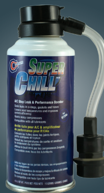
945KIT SUPER CHILL™